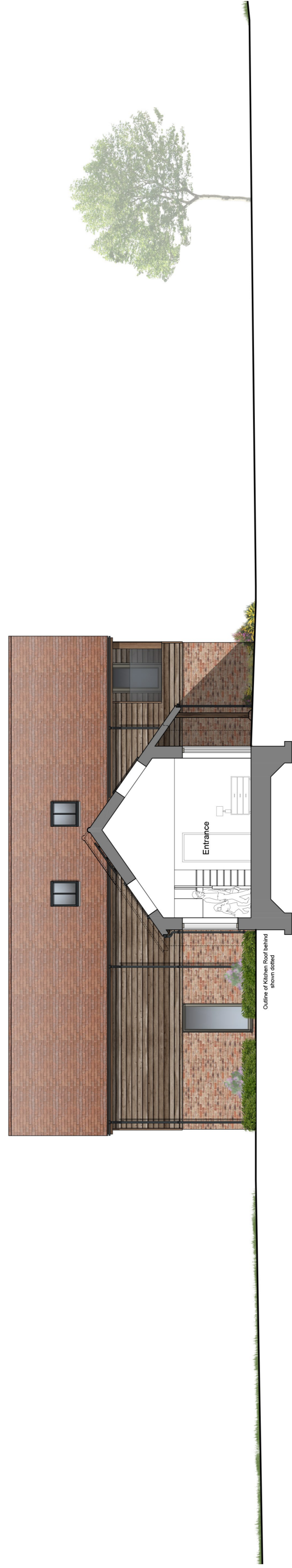
Plot 3 - Section B-B (side)