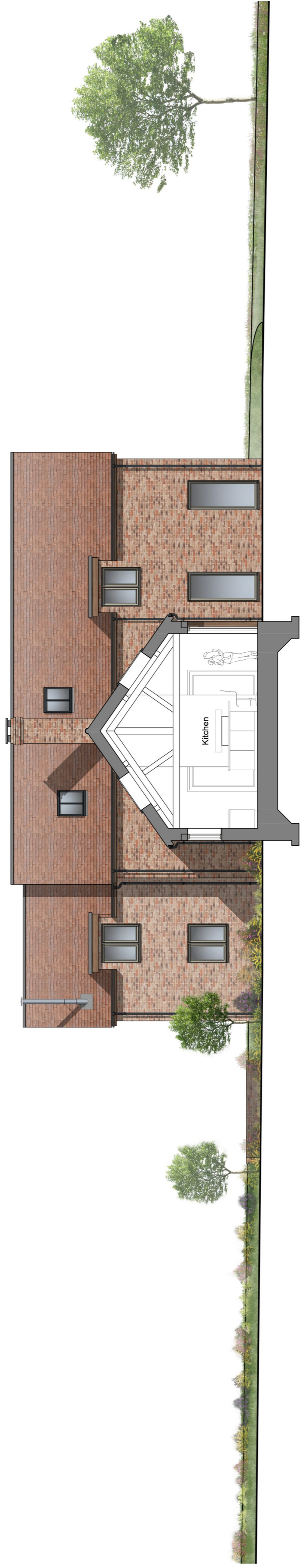
Plot 3 - Section A-A (side)